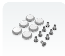
• Fastening set