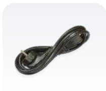
• 2 Power cords